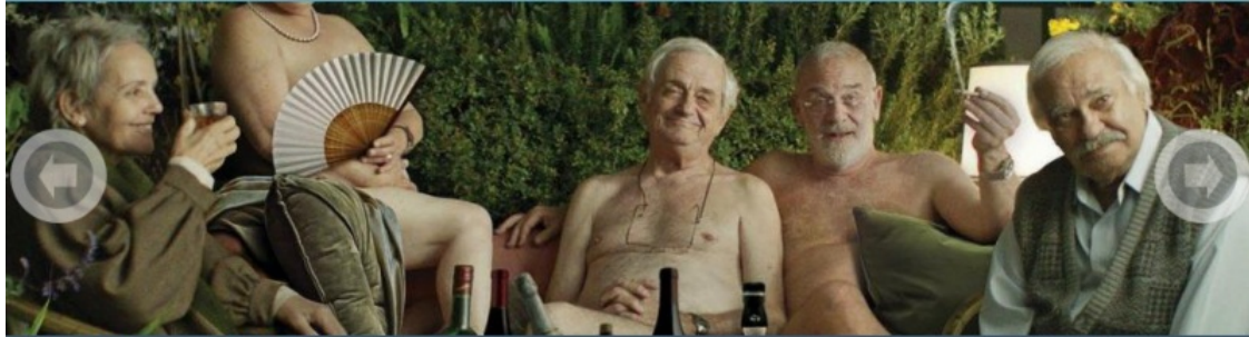
The Farewell Party Tal Granit & Sharon Maymon | 95 min. ★★★★★ Watch Now

A Palestinian Israeli writer struggles with an identity crisis. A new drama series from Sayed Kashua.